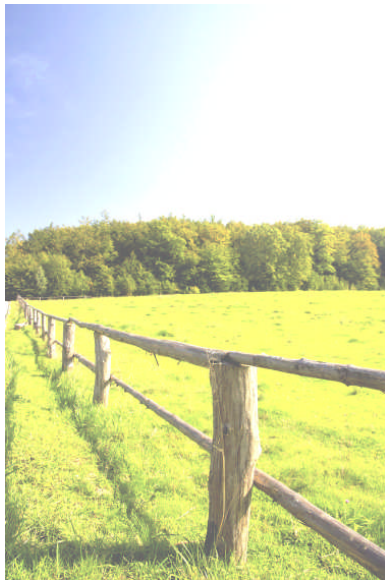
Nearly 6,200 acres in Haycock Township have been preserved using various programs

The e-mail is generally sent out at the end of the month, but occasionally will be skipped if there is no news to report. On rare occasions we will send out quick notices at other times, such as when there were robberies in the area. This is only done when absolutely necessary as to respect your privacy as much as possible. All of the newsletters are archived on our website under the "Newsletter" tab. Also in that tab is the link to the form to sign up for the newsletter. We promise to never disclose your email address to anyone, ever!